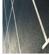
Car Park Construction