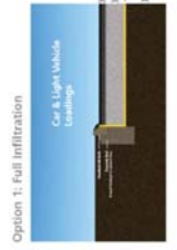
Option 1: Full Infiltration Car & Light Vehicle Lane