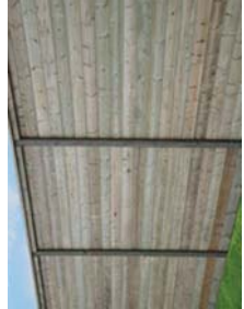
Acoustic Fencing (all boundaries)